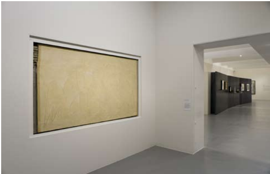
Picasso Peace and Freedom TATE Liverpool exhibition images