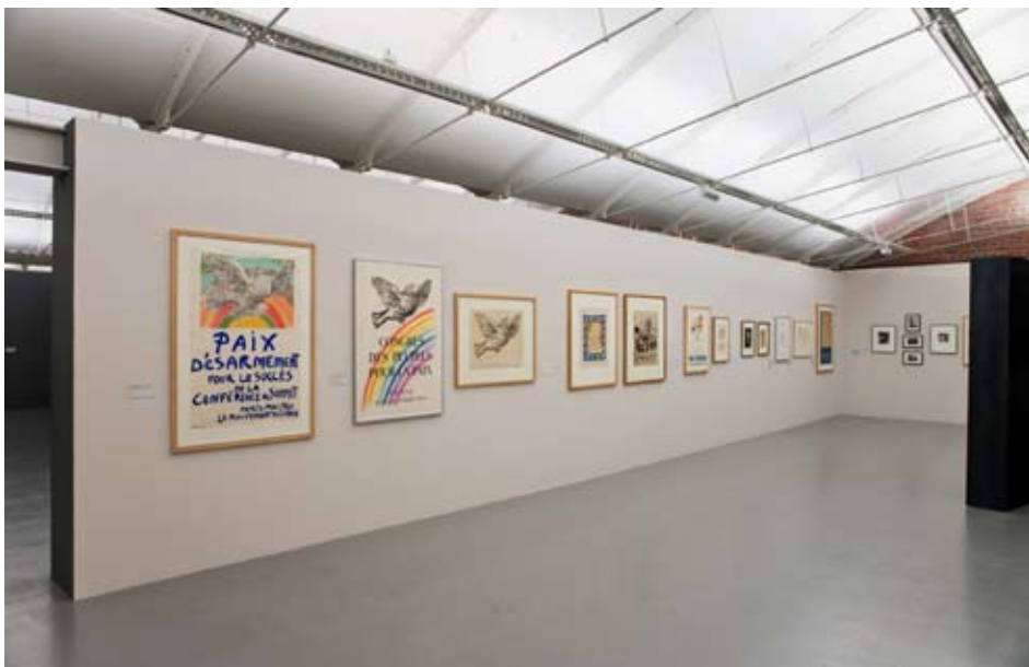
Picasso Peace and Freedom TATE Liverpool exhibition images