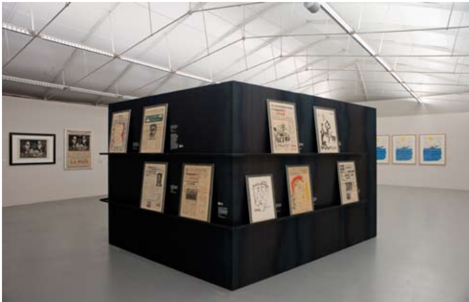
Picasso Peace and Freedom TATE Liverpool exhibition images