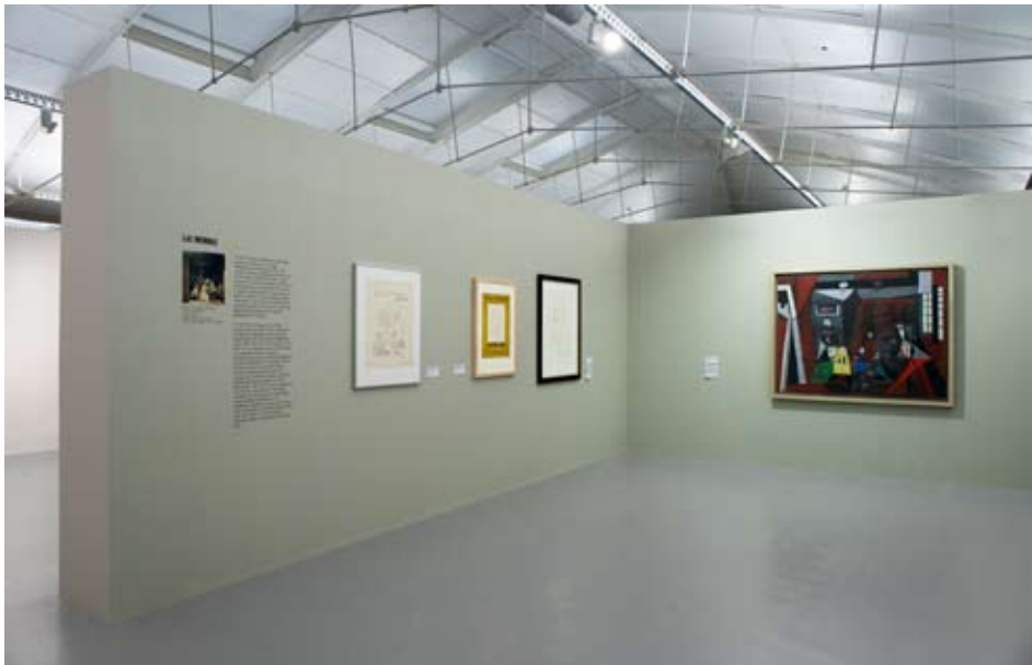
Picasso Peace and Freedom TATE Liverpool exhibition images