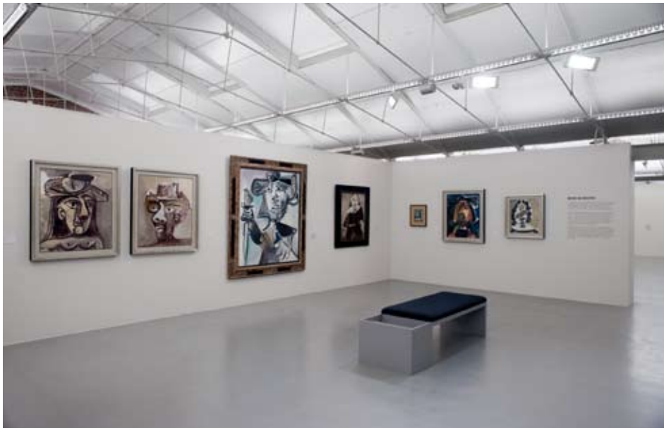
Picasso Peace and Freedom TATE Liverpool exhibition images