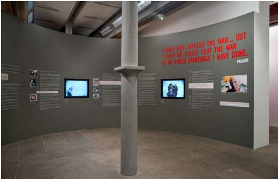
Picasso Peace and Freedom TATE Liverpool exhibition images