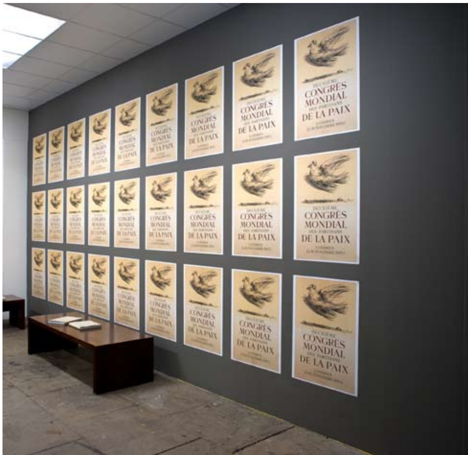
Picasso Peace and Freedom TATE Liverpool exhibition images

Tate Café will be serving a special tapas menu.