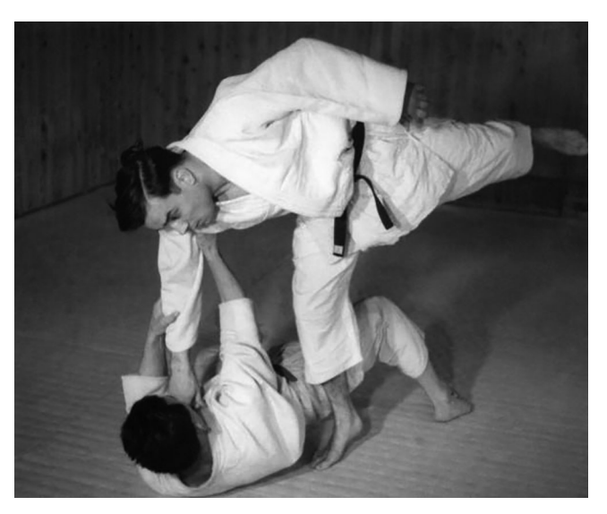
Figure 3 Master Sampei Asami performing the Koshiki-no kata ( kata of ancient forms), dojo (workplace) of Master Asami, Tokyo, 1953.