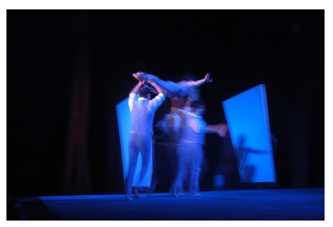
Figure 6 Aerial dynamism in Architectura del Aire.

For instance, Arquitectura del Aire involved the imaginal flight of one human body in space. We did not install a trapeze to lift the performer. Neither did we use virtual reality to generate an illusion of flight. Instead, we created an imaginary gravity-free journey in which the performer soared, swooped, turned, rolled forward and in reverse, floated, fluttered, climbed, glided and hovered without once touching the ground. Three base-lifters, in conjunction with the flyer, mediated between structurally exploring shifting the weight between hands, feet, knees and hips and sensing the three dimensionality and integration of all bodies involved (Figure 6). While we were not trained acrobats, judo had imbued our working strategies with the dynamic interplay or physical conversation between the flyer and the lifters. We did not attempt to hide the mechanical workings of levitation. The 'trick' was declared throughout.