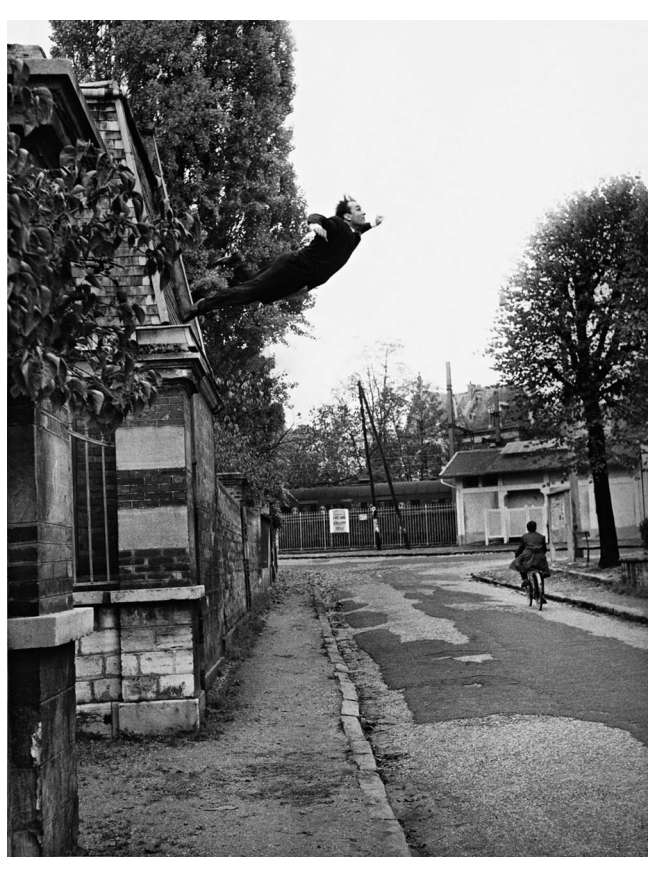
Figure 4 Leap into the Void by Yves Klein.

deeply influenced by Bachelard's philosophy of material imagination<sup>4</sup> and in his 1959 lecture, he acknowledged his debt to Bachelard: