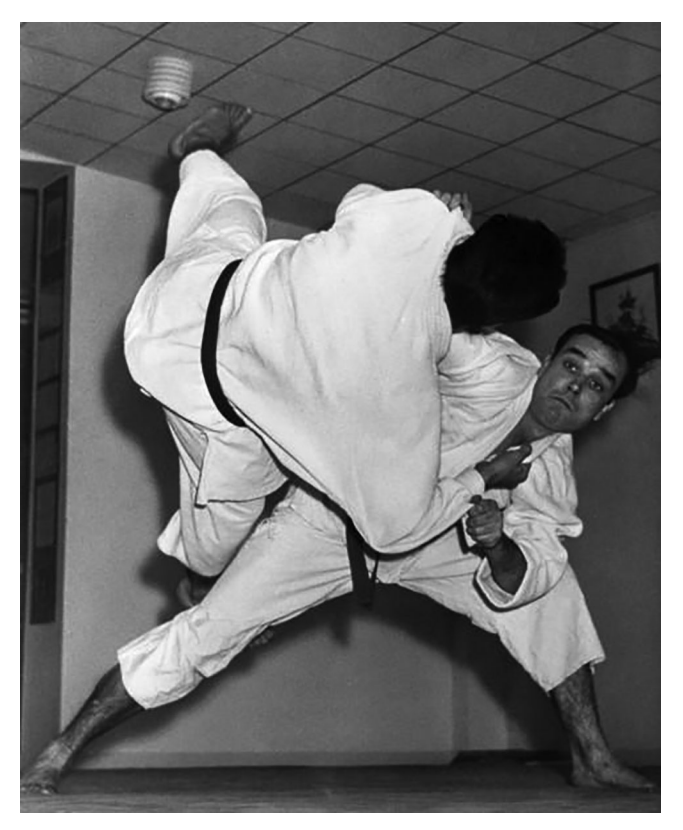
Figure I Klein using judo flips, 1960.

As mentioned earlier, the impulse for Arquitectura del Aire was the work of artist Yves Klein. In our particular context it is important to point out that during the Pinochet dictatorship, much international art had been conveniently ignored or overtly censored. This left a significant knowledge gap during the late 20 and early 21st century in Chile, which the group for this project was keen to rectify. Born in 1928, seven years after Lecoq, Klein died young of a heart attack aged 34 in 1962. A devoted practitioner of judo, Klein left France in 1952 for Japan where he became a fourth dan judoka , a level in judo that at the time no French person had reached. At the age of 24 he went on to teach at the Spanish Federation of Judo in Madrid and subsequently opened his own judo school in Paris. Klein also wrote the book Le fondements du judo (1954), translated into English as The Foundations of Judo (2009). The following images capture Klein in action (Figures 1, 2 and 3).