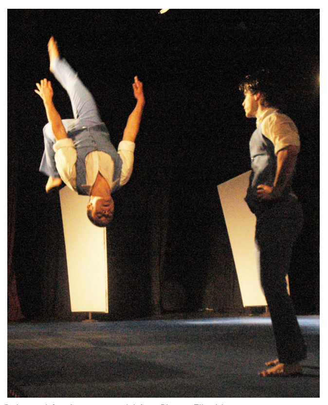
Figure 5 Rehearsal for Arquitectura del Aire.

Developing a sound understanding of kuzushi (breaking the opponent's balance), we were introduced to the principles of giving way, maximum efficiency and mutual respect. From a training perspective, following the force applied by the opponent and making use of that force with flexibility and ease, progressively increased our physical confidence for jumping, tumbling and balancing (Figure 5).