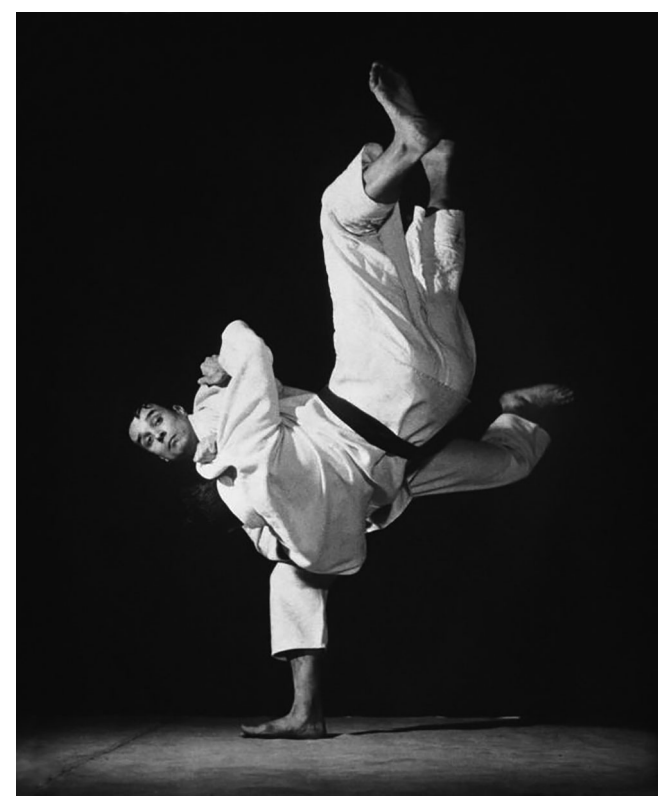
Figure 2 Klein doing a judo takedown, 1955. © Succession Yves Klein c/o ADAGP, Paris and DACS, London 2022.